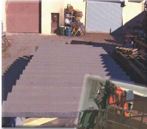
BROAD STREET STATION STAIRS