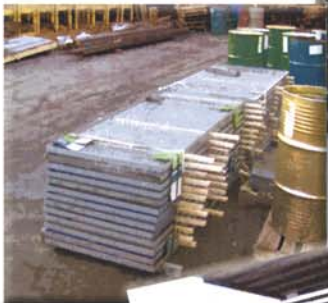
MESH SCREENS (BROAD STREET STATION)