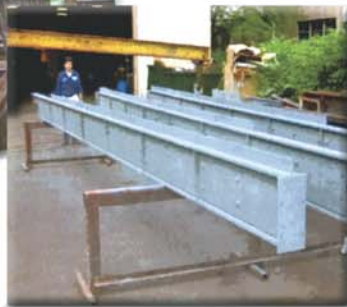
WIND BRACING (UVA ARENA)