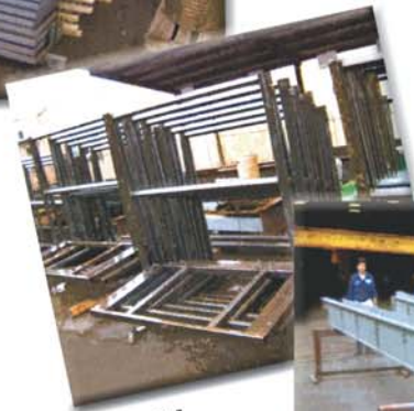
CUSTOM RACKS (BORGATA CASINO)